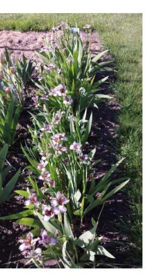
A row of Mirame