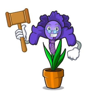
-11- Region 6 Spring 2020